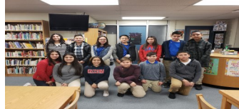
Monthly Eagles of the Month